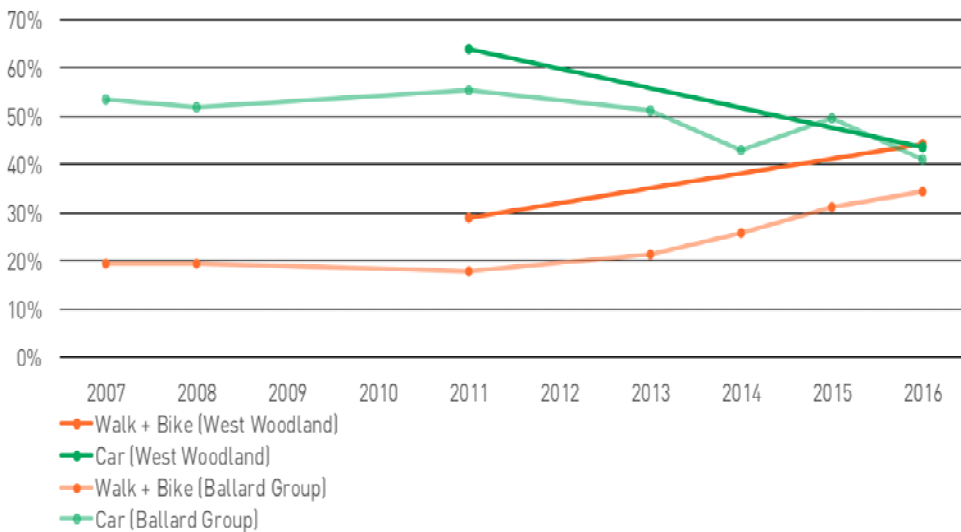
How has our school performed recently vs. similar schools?